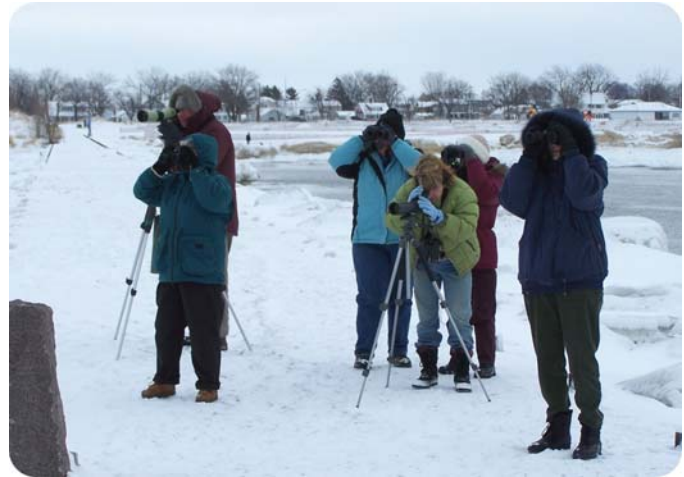
Capital Area Audubon's 2009 field trip to the Muskegon area. Check out Saturday's Muskegon trip on the next page.

Nature Discovery's mission statement, dedicated to enhancing awareness of, and sensitivity toward Michigan's living resources through natural science education , may require an addendum to fit the 21 st century. Something like ...and also dedicated to urging citizens to take time to step away from the virtual world and toward the natural world to which we, as biological beings, belong. More bluntly, Get off the screens, unplug your buds and pay attention to the real world!