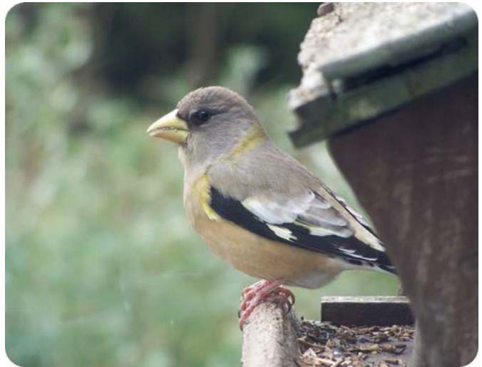
This female Evening Grosbeak, a rarity in Lower Michigan, made a brief appearance one day in November, 2007. Over 21 years, it is the sole sighting of this species on our property. Surprises like this are a possibility on any day when you maintain a “bird restaurant” that’s open 24/7.

At 2pm, Power Bird-feeding for Maximum Birds and Enjoyment will be presented. By way of Powerpoint images and a walk through our two active feeding stations, participants will learn why treating your feeding station as if it is your own upscale restaurant is sure to bring in the maximum abundance and variety of birds. Learn about the best variety of seed, the best mix of feeders, and how to easily enhance the “ambiance” to suit the taste and comfort of the pickiest patrons.