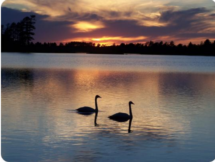
A Trumpeter Swan sunset at Seney National Wildlife Refuge.

Join our economical 5-day guided tour in Michigan’s Upper Peninsula within an intimate group of no more than 5 people. Our goal is to experience as many species as possible, emphasizing locations to tally specific U.P. gems, like Connecticut Warbler, LeConte’s Sparrow, Upland Sandpiper. Destinations include Kirtland’s Warbler habitat on our way north, Munuscong Marsh, Whitefish Point, Seney National Wildlife Refuge, and more. On the 2012 trip the group tallied 129 species! COST: $650 ($250 deposit), includes all transportation, lodging, 4 breakfasts and 4 road-lunches. Any child is welcome to attend accompanied by an adult. Contact us to enroll or for more information.