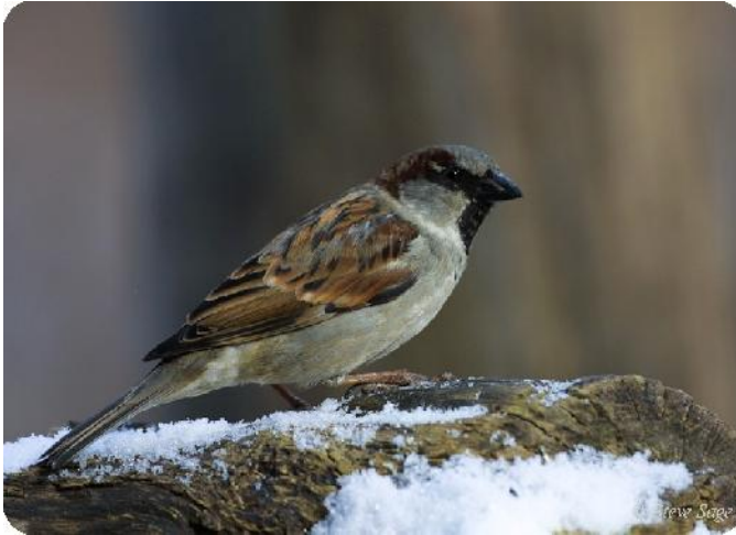
A male House Sparrow will kill eggs, young and adults of other species to gain a nesting cavity.