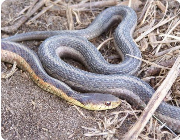
The existence and location (our yard) of these Eastern Garters was submitted to the Michigan Herp Atlas.