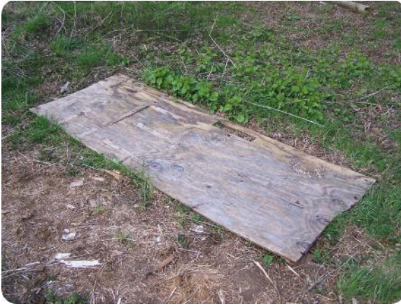
To aid in finding snakes, salamanders and other small wildlife on your property, convert any old board or door to a "hide board" laid in the overgrowth that's convenient and easy to check. Garter snakes are regularly found under this one.

(Herpetology: the study of reptiles and amphibians), and shortened further by those in the field to "herps.") you may have fun participating in the Michigan Herp Atlas. The project was devised through collaboration of the Michigan DNR, Michigan Partners in Amphibian and Reptile Conservation, Michigan Society of Herpetologists, and Herpetological Resource and Management.