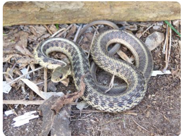
This small Eastern Garter shows its displeasure after being exposed from under the hide board. Note the flattened posture exhibited by most upset snakes.

Attend this Sunday's Biodiversity Day. I'll show you the herp atlas app in action when we locate a garter snake, frog or turtle on our acreage.